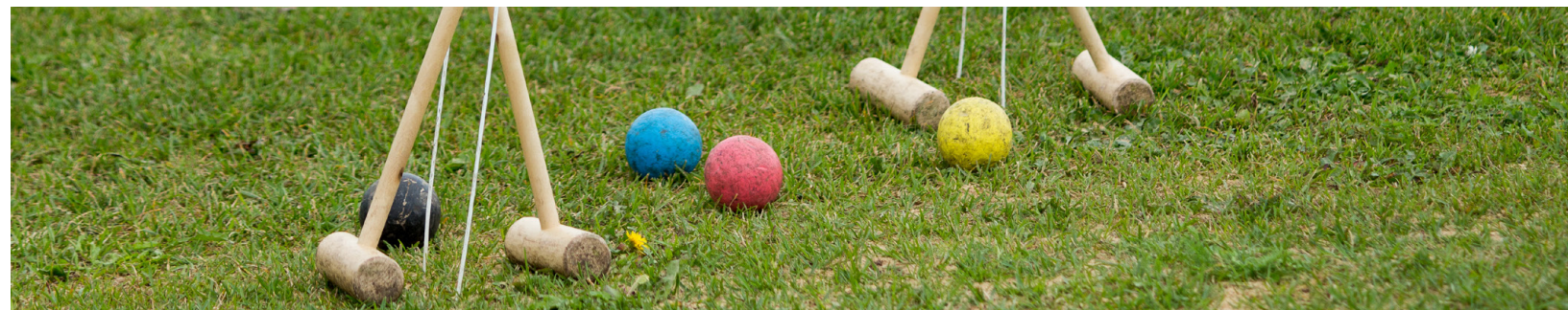
An afternoon of croquet on the lawn perhaps? Why not accompany it with cream tea & Pimms... a lovely treat. There are plenty of other lawn games too...