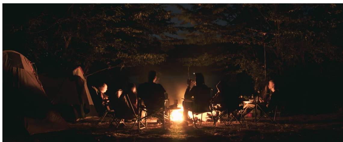
The primordial power of gathering around fire - with a tot of something or two!

We've plenty more ideas too, from treasure hunts to bike rides to Balfour Winery tastings. For any of these, or perhaps something else you have in mind, just contact our events team: imsales@alexanderhotels.com