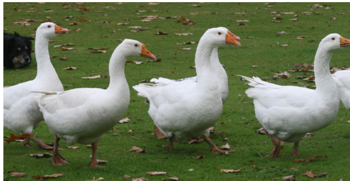
You'd be quackers not to give duck herding in the grounds a go...