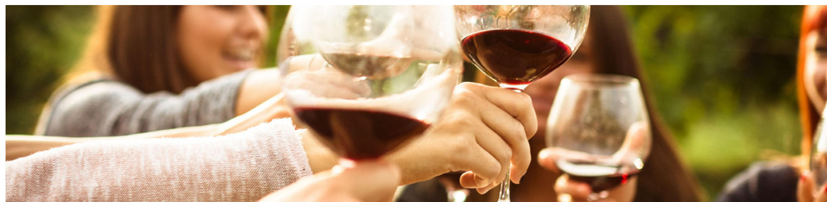
Need we say more? We love this snap of a team enjoying a wine tasting, which you can take as seriously (or not) as you please. We've plenty of grapes to try and our sommeliers know their stuff but can make a tasting great fun too.